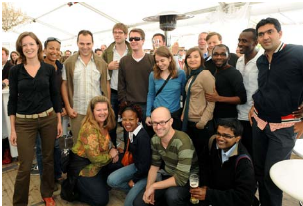
The team of Men's Health