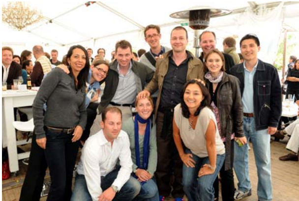
The team of Spotlight