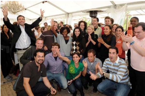
The team of Cosmopolitan