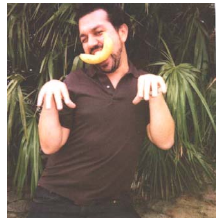
Cosmopolitan's cooking instructions Banana XL