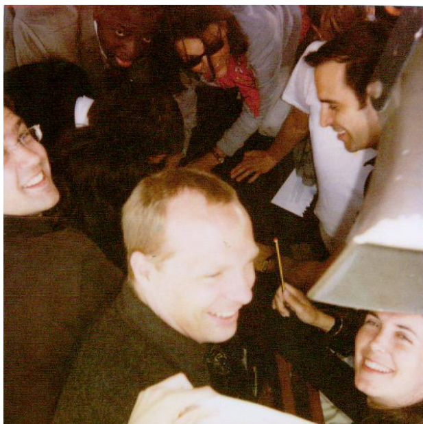
Time Magazine's action

Down by the Reeperbahn, in a dark grungy attic, Pimps and bankers count away. It's all to erratic! Nothing is excessive, too stark or dramatic. For regulars and day trippers in the City Hanseatic.