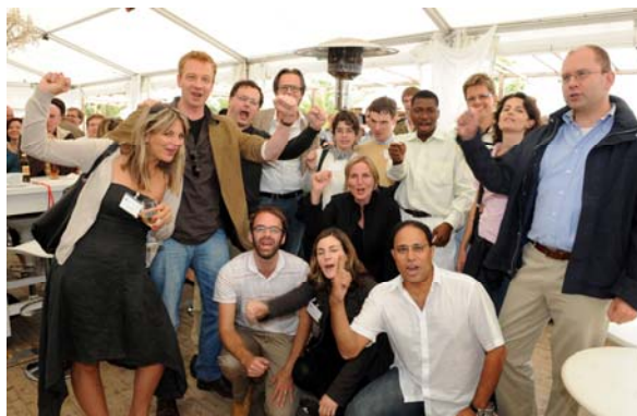
The team of Vogue