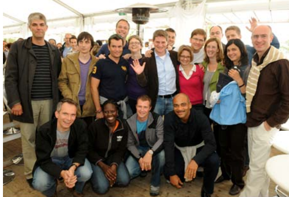
The team of House & Garden