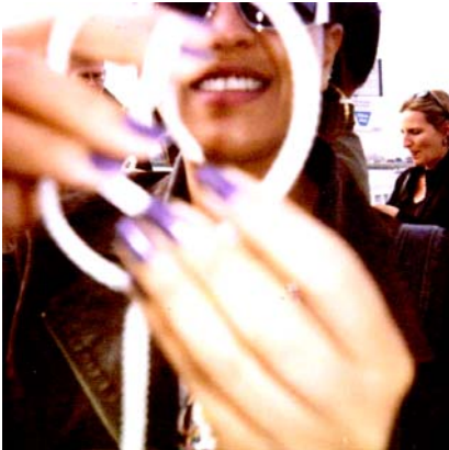
Vogue - News team gets entangled