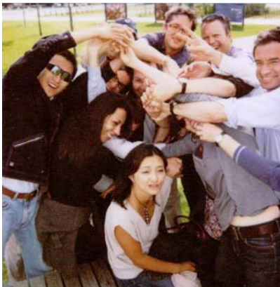
Spotlight gets entangled