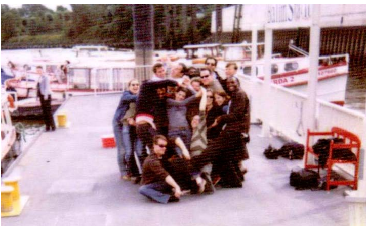
Men's Health - tangled up

Ahoi, Moin Moin, What shall we do with the drunken sailor