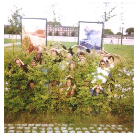
Home & Garden