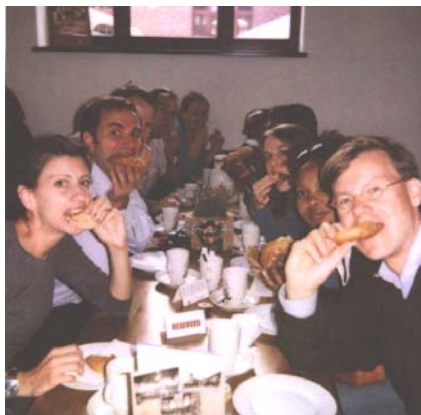
Men's Health's extra energy for in-between