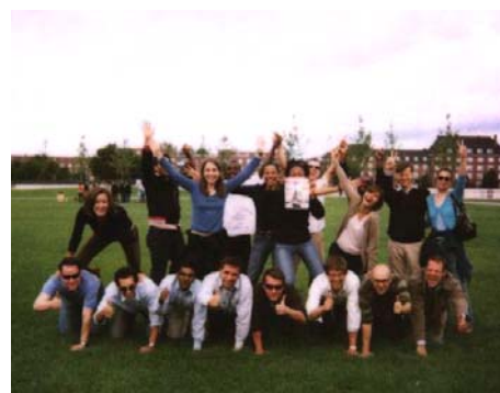
That's Men's Health pure freedom