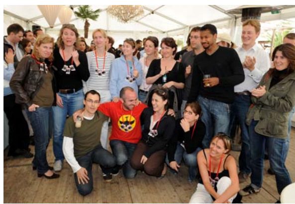
The team of The Sun