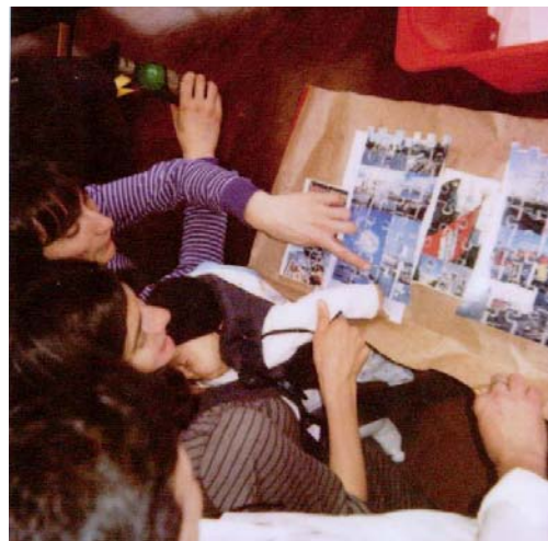
The Team of House & Garden working