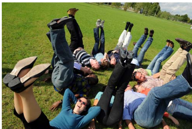
The dashing reporters of National Geographic

Ladies, pay attention! To reach the land of the free, you must get into shape (60-90-60 ideally). Don't forget your morning exercise and your daily apple - you'll need all of your strength and healthy teeth to survive the journey to paradise