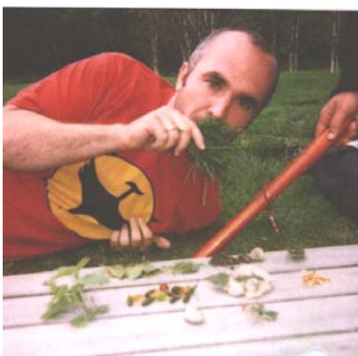
The Sun's extra energy for in-between

Find an enormous ripe banana and grip it firmly in your left hand. With the right thumb and index finger gently stroke down the peel. Next hammer some red chili on the banana. Enjoy!