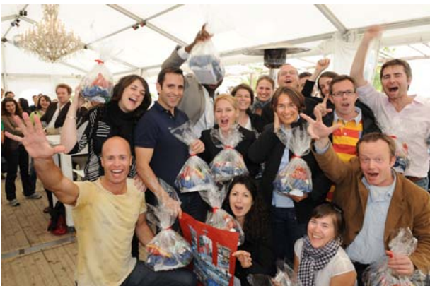
The team of Time Magazine