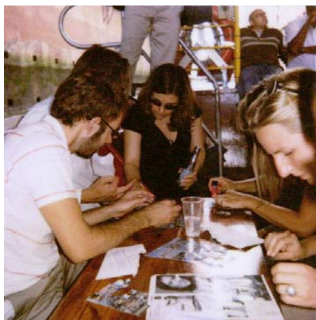
Vogue in action

Where my dreams begin, In houses constructed by Mr. Ballin, Emigrants depart for the states in a boat, Hoping it will stay afloat. For us, Franzbrötchen were à la carte, Before we embarked on our Bootfahrt. They were looking towards the western side, Now our prospects are worldwide.