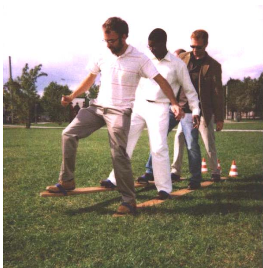
Vogue's dashing team of reporters