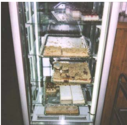
House & Garden's snack