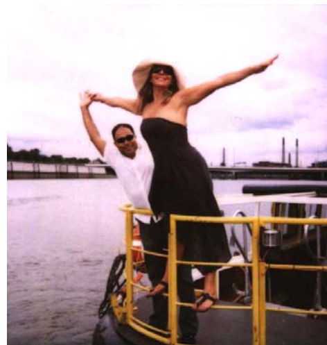
Vogue's idea of pure freedom