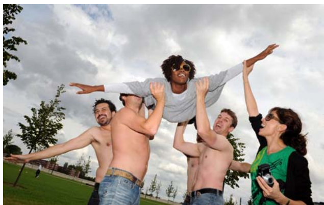
Cosmopolitan's impression of pure freedom

P.S.: She's turned on by uniformed Immigration officers.