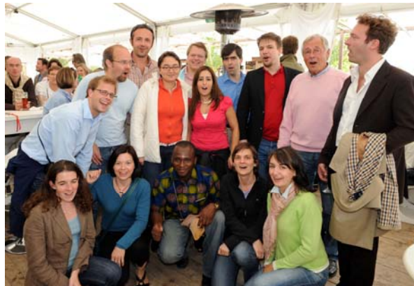
The team of National Geographic